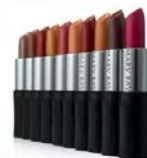
Mary Kay Crème Lipstick

Start something beautiful! There's nothing like a new year to inspire a new start, new ideas and new ways to look your best. Mary Kay can make it easy with the hottest products—like new Mary Kay Mineral Powder Foundation and the latest shades for sensational lips. They're everything you need to make all your beauty resolutions come true from America's best-selling brand.