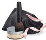
Mary Kay Mineral Powder Foundation & Brush Kit