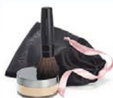
Mary Kay Mineral Powder Foundation & Brush Kit