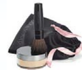
Mary Kay Mineral Powder Foundation & Brush Kit