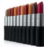
Mary Kay Crème Lipstick

Start something beautiful! There's nothing like a new year to inspire a new start, new ideas and new ways to look your best. Mary Kay can make it easy with the hottest products—like new Mary Kay Mineral Powder Foundation and the latest shades for sensational lips. They're everything you need to make all your beauty resolutions come true from America's best-selling brand.