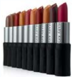
Mary Kay Crème Lipstick

Start something beautiful! There's nothing like a new year to inspire a new start, new ideas and new ways to look your best. Mary Kay can make it easy with the hottest products—like new Mary Kay Mineral Powder Foundation and the latest shades for sensational lips. They're everything you need to make all your beauty resolutions come true from America's best-selling brand.