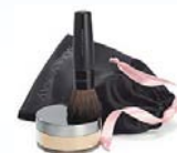
Mary Kay Mineral Powder Foundation & Brush Kit