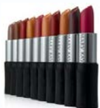
Mary Kay Crème Lipstick

Start something beautiful! There's nothing like a new year to inspire a new start, new ideas and new ways to look your best. Mary Kay can make it easy with the hottest products—like new Mary Kay Mineral Powder Foundation and the latest shades for sensational lips. They're everything you need to make all your beauty resolutions come true from America's best-selling brand.